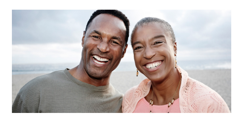
DENTAL INSURANCE THROUGH APTIA365:

During your consultation with your benefits counselor, he or she will review all of your benefits options with you, discuss your personal situation, and answer any questions you may have. Your benefits counselor will help educate you about additional insurance options available that you may wish to consider in order to make the best possible decision for you and your family.