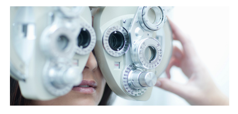
VISION INSURANCE THROUGH APTIA365:

Enrolling in dental insurance can be a cost-effective way to address the costs of annual exams and related services such as fillings and extractions. Dental insurance can play an important role in your health. Since people with dental insurance are more likely to visit the dentist, a solid insurance plan can help you maintain good oral health, which promotes your overall health.